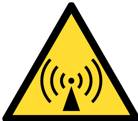
Figure 1: RF Hazard warning sign

RF sources normally have a simple warning sign on the front or rear of the antenna, making those that are accessing the site aware that it is an RF Source. An example of the sign is in Figure 1.