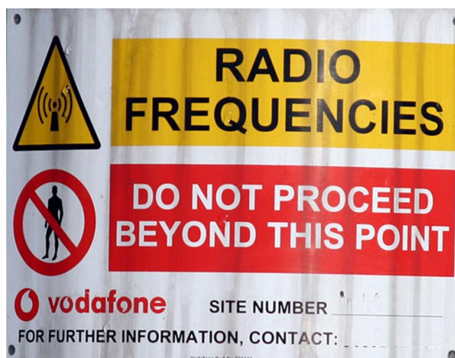
Figure 3 – Exclusion zone signage