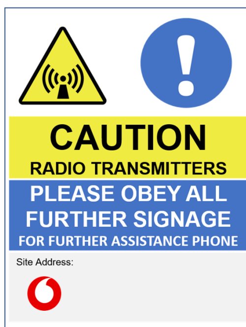
Figure 2 – Example of signage at entry point of site

The last sign is to located that boundary of any Exclusion Zone and gives clear instruction not to proceed beyond this point. If access is required to this area, the site must be shut and the antenna isolated. An example of the sign is presented at Figure 3.