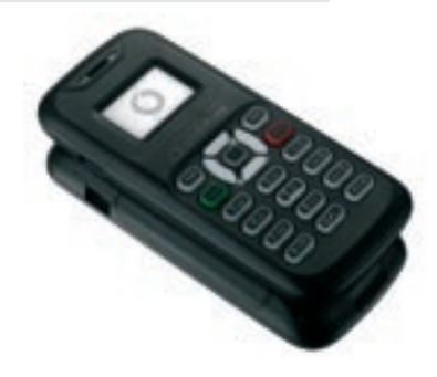
Product focus: Vodafone 150 Our most affordable handset to date.

The cost of mobile handsets can be one of the most significant barriers for people in accessing and benefiting from the growing number of socially valuable mobile services. In February 2010 we announced the launch of Vodafone 150, an extremely affordable handset that retails unsubsidised at below US$15 depending on the local market. These innovations reduce the cost barriers to the adoption of mobile communication making new technologies available in emerging markets.